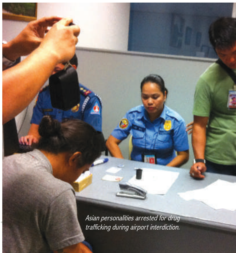
Asian personalities arrested for drug trafficking during airport interdiction.