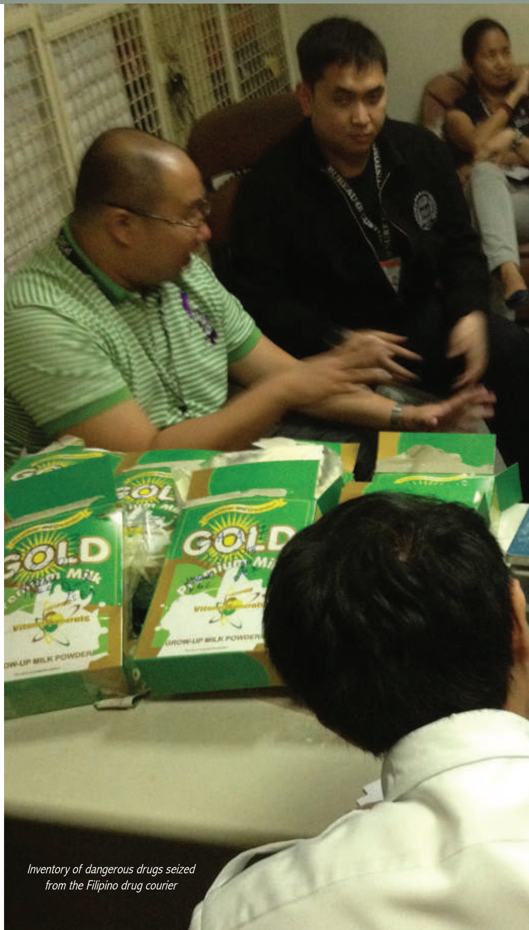
Inventory of dangerous drugs seized from the Filipino drug courier

The highest ranking elected politician arrested since 2002 was accomplished in 2013 with the arrest of a Board Member of 1st District Cagayan de Oro on January 8 during a buy-bust operation conducted by operatives of PDEA RO 10 at Zone 2, Agusan, Cagayan de Oro.